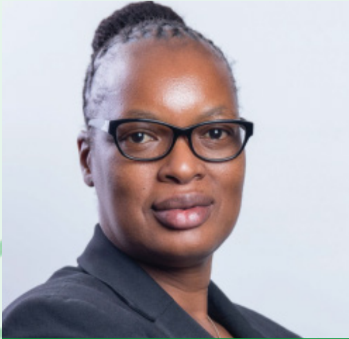
Ms Felicia Dlamini-Kunene Deputy Governor of the Central Bank of Eswatini