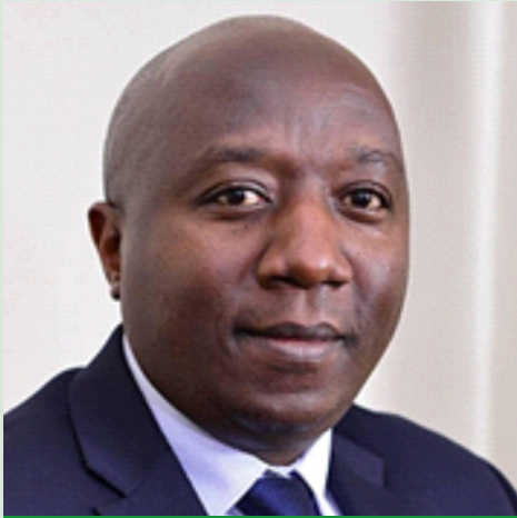
Rt. Hon. Dr. Edouard Ngirente Prime Minister of the Republic of Rwanda

Since August 30 2017, Rt.Hon.Dr. Edouard Ngirente is the Prime Minister of the Republic of Rwanda.