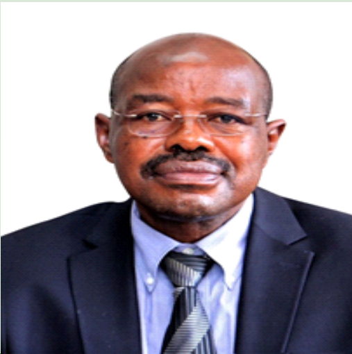
Hon. Amos Lugoloobi Uganda Minister of Finance, Planning and Economic Development