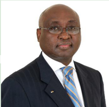
Dr. Donald Kaberuka Chairman and Managing Partner SouthBridge

Dr. Donald Kaberuka is the Chairman and Managing Partner at SouthBridge, Emeritus President, African Development Bank (2005 – 2015), Special Envoy of the African Union on Financing, the Peace Fund and COVID - 19 response and Former Minister of Finance and Economic Planning, Rwanda (1997 – 2005).